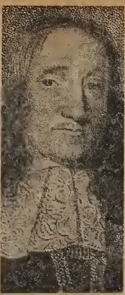
Arthur Annesley, Earl of Anglesey, 1661.

This Annesley had a son Arthur, born in 1614 in Fishamble Street, then one of the choicest haunts of aristocracy in the city. Arthur followed father into politics and in the course of a prosperous career managed to lay hands on vast tracts of land in almost every county of Ireland. At one time the Annesleys owned virtually the whole of Co. Wexford. Later generations, in true Irish 18th century style, worked their way through the bulk of the family fortune, but the official return of landowners made a century